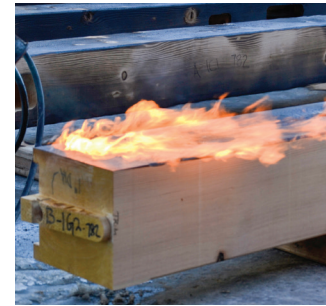
Shou Sugi Ban—Charred