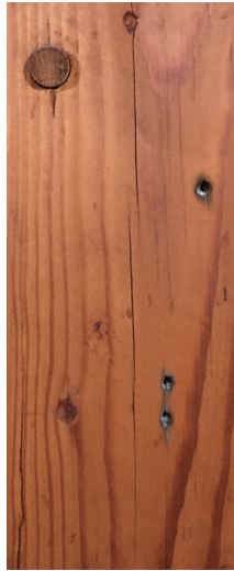
Resawn & Planed