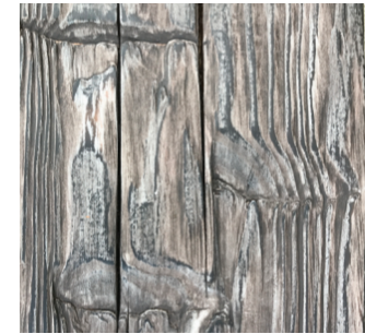
Applied Hewn and Multitone