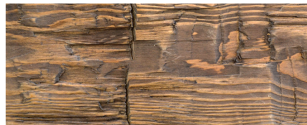
Hand-Hewn Agricultural Timbers Come in Various Tones and Textures