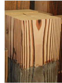
Surfaced Four Sides