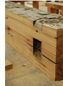
Sawn One Side

Our custom milling can provide you with smooth S4S faces, band sawn, or in some cases circular sawn surfaces for any of our reclaimed timbers. While surfaces will be cleaner, character including bolt holes, nail holes, bug holes, ferrous staining, checking, and other marks will remain visible. Our mills in NY and OR offer mitered box beams, jacket boards, applied hewing, other textures, and many color options.