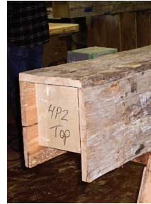
Box Beams and Jackets