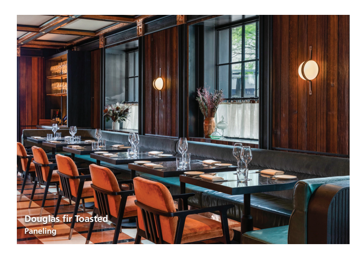
FSC®-CERTIFIED DOUGLAS FIR:

Solid: 5" face width, 6'-16' random lengths. Available as interior paneling and exterior siding.